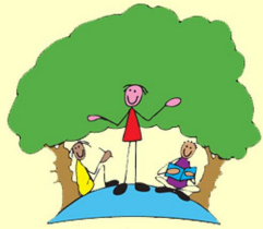
Marpool Primary School